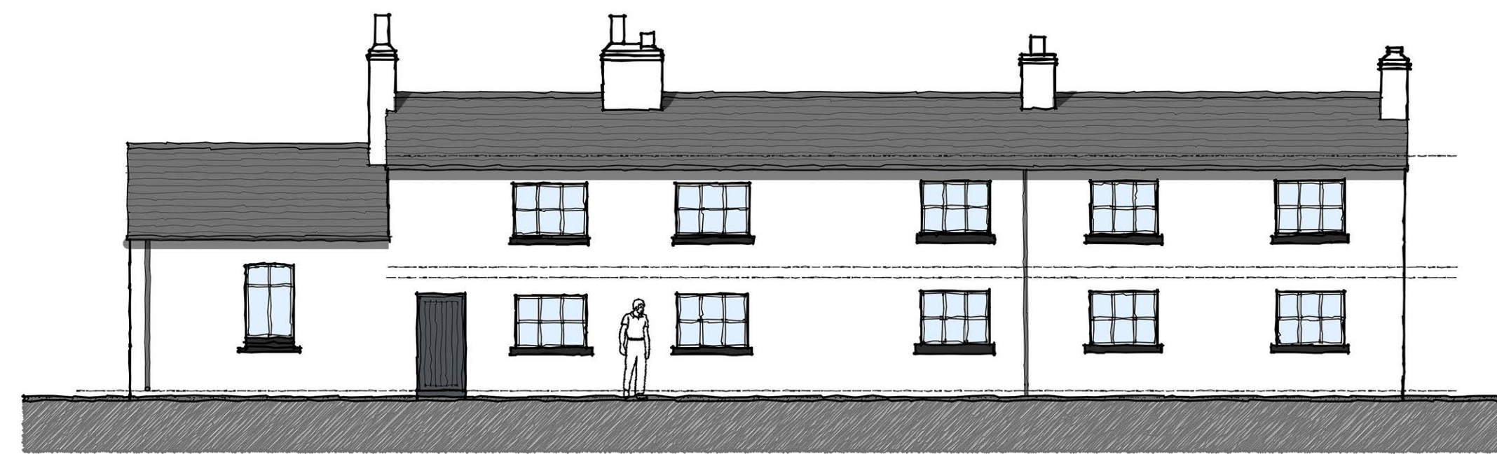
Proposed Front Elevation (Halebank Road) Scale 1:100