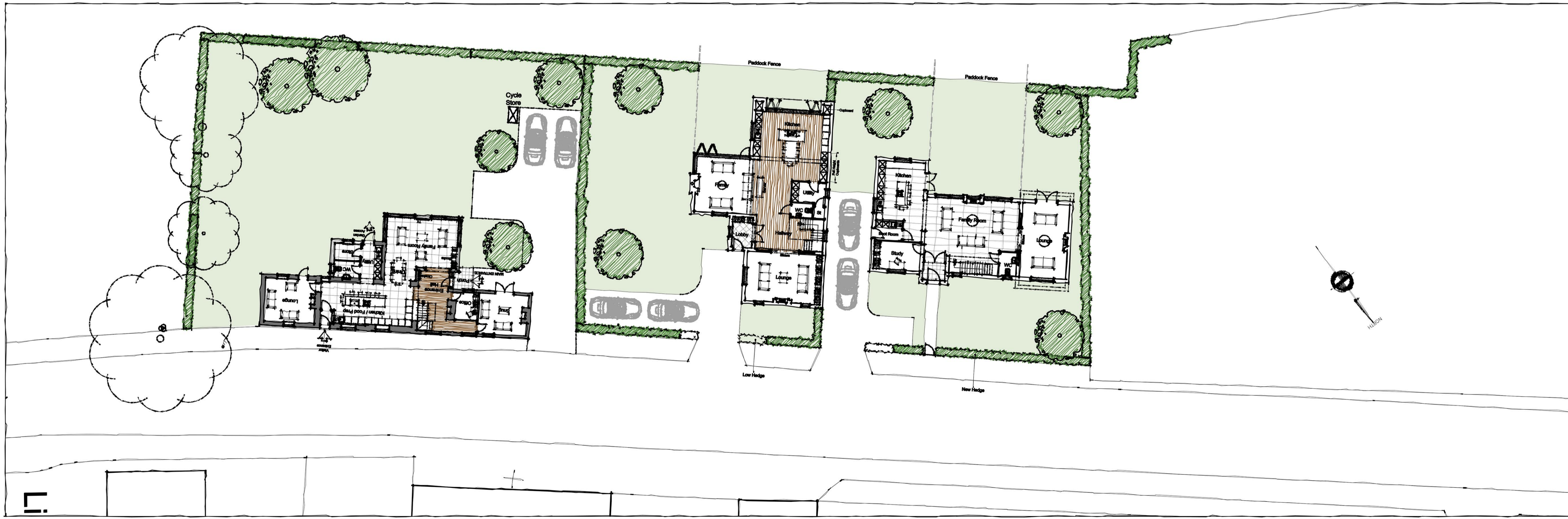
Proposed Site Plan Scale 1:200